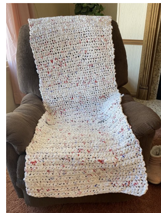
Joyce Iltis created this mat

We would like to crochet mats for people to use for sleeping when outside. These are made of strips of plastic grocery bags and then crocheted together. It makes a lightweight mat to protect from the cold ground.