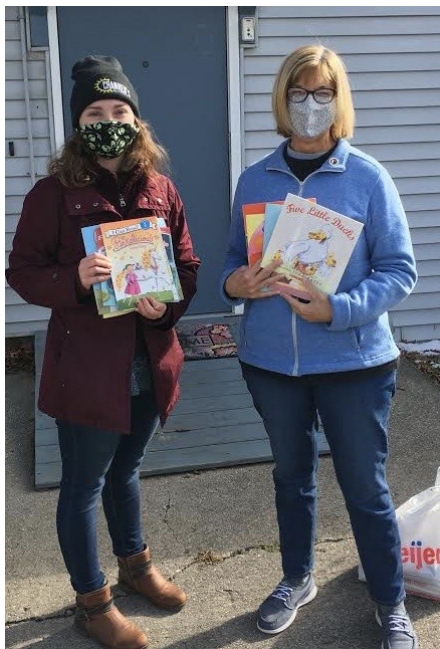
WISE staff member with Celeste.