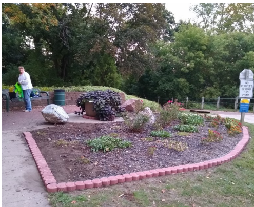
Riverwalk garden now has beautiful pavers to define the garden.