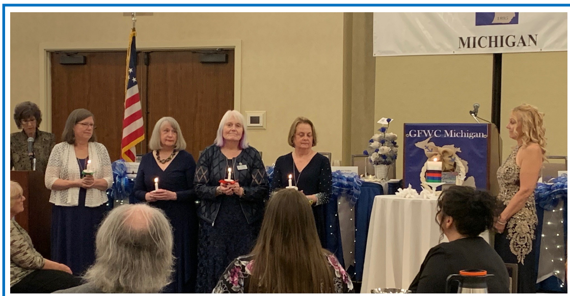
2022—2024 GFWC Michigan Board of Directors