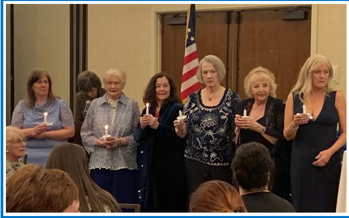
2022-2024 GFWC MI DISTRICT PRESIDENTS