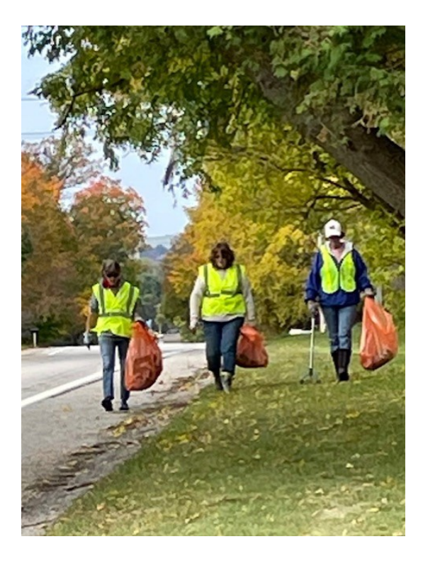
Done!!!! Good job Environment Team!