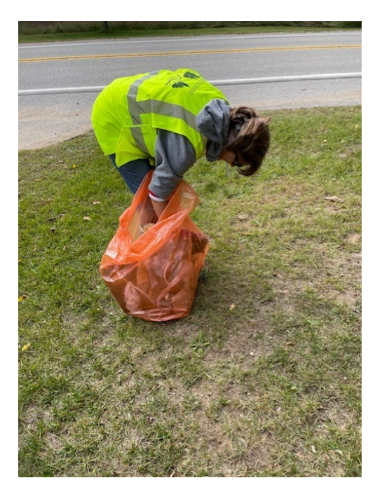
"Where is that golf ball I found?"