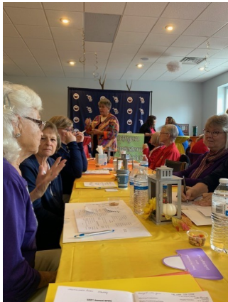
One of three tables of attendees.