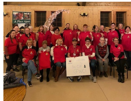
Group picture of those attending.