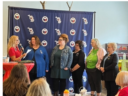
Installation of NWD Officers