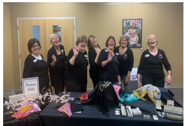
Committee before 4B's fundraiser!