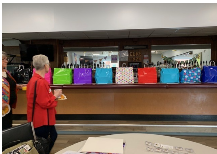
Wacky Bag Fundraiser