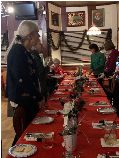
Centerpieces created by the Environment CSP.