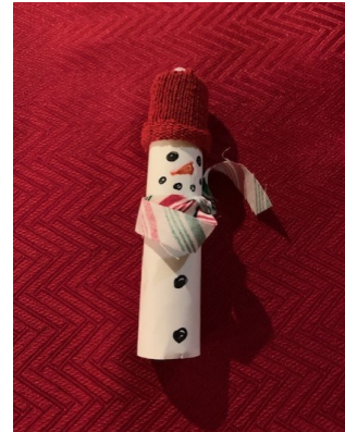
Table favors created by Delores Simpson.