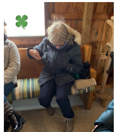
As you can see, we had an electrifying time.