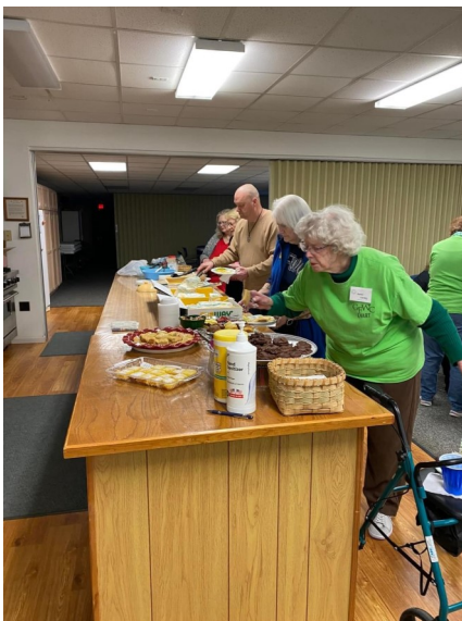
A great Northwestern District Gathering was held on March 16, 2024 in Ewart, MI. A total of 18 NWD club members attended as well as one State officer and guest.