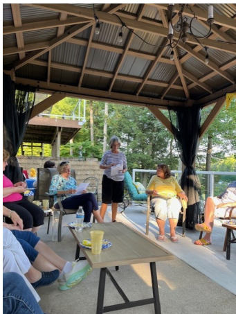
Celeste shared information about the mum sale.