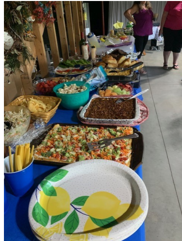
The food was great!