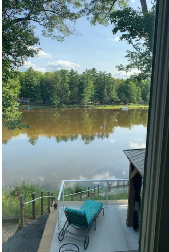
Beautiful evening for a picnic.