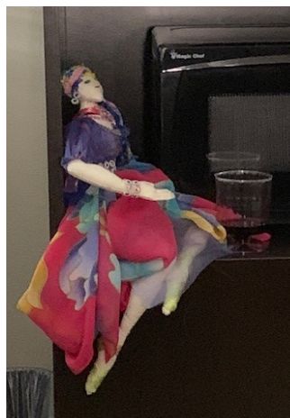
Crystal taking a break.