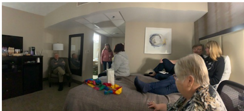
Ms. Federation celebration after Ms. Federation banquet.