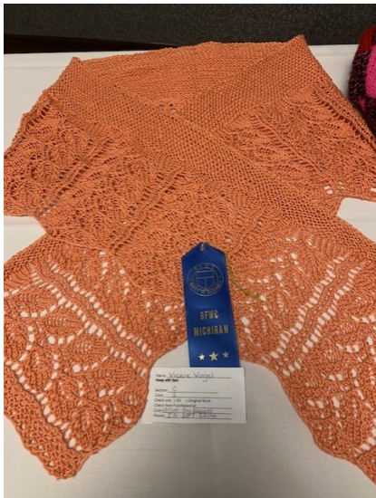
VICKIE VOGEL'S ENTRIES