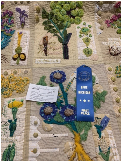
DELORES SIMPSON'S ENTRIES